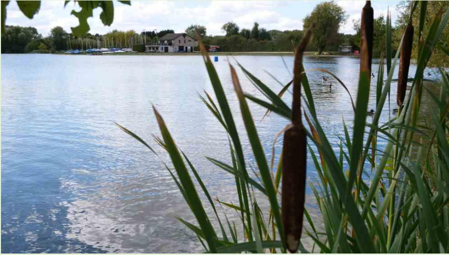
Bedford Priory Country Park marina (Adriana Ford)