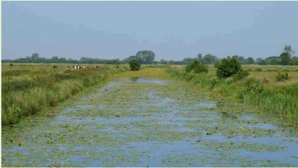
Somerset Levels: Westhay Moor