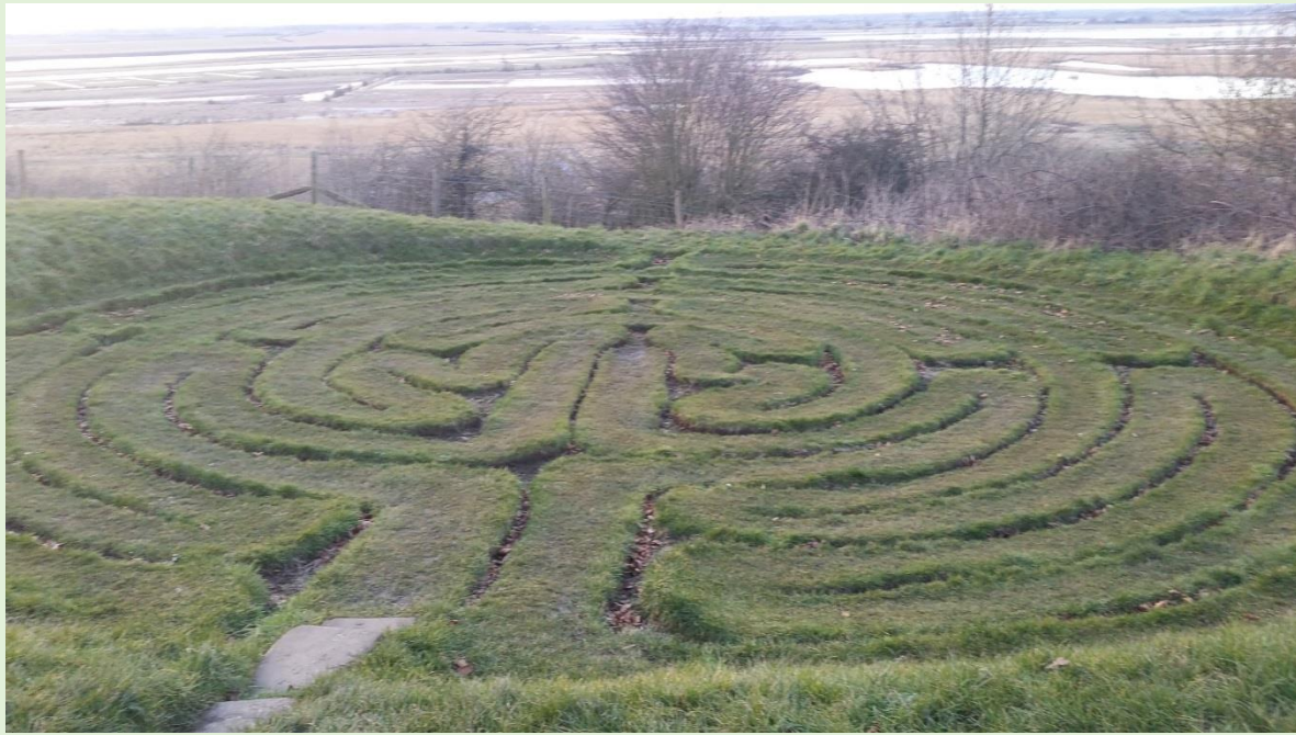
Julian's Bower overlooking Alkborough Flats: (Mary Gearey)

English wetlands as ludic spaces for recreation and play, supporting physical and relational wellbeing