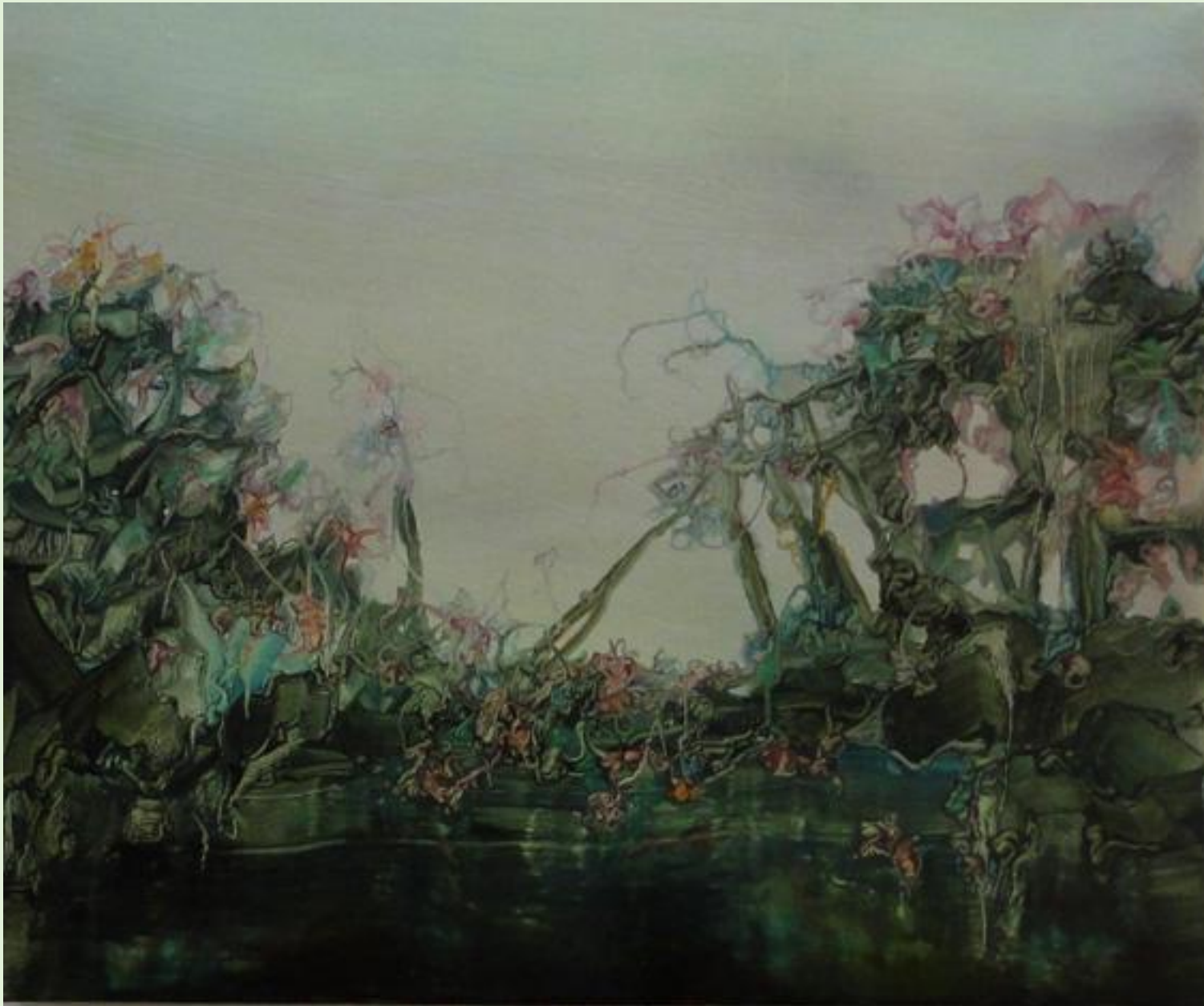
Michele Fletcher: Morass