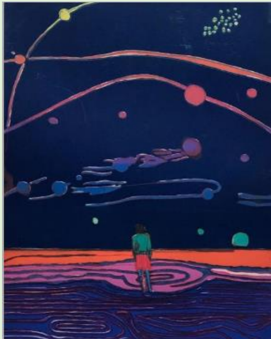
Tom Hammick: The night is a starry dome

To use these findings together with WetlandLIFE's ecological, entomological and economic work to support evidence based recommendations for wetland site managers.