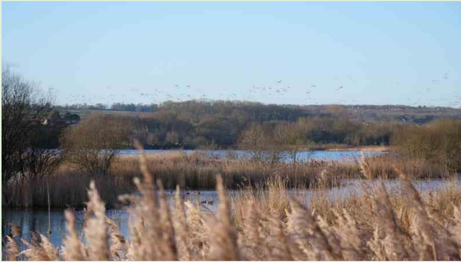
Somerset Levels: Shapwick Heath