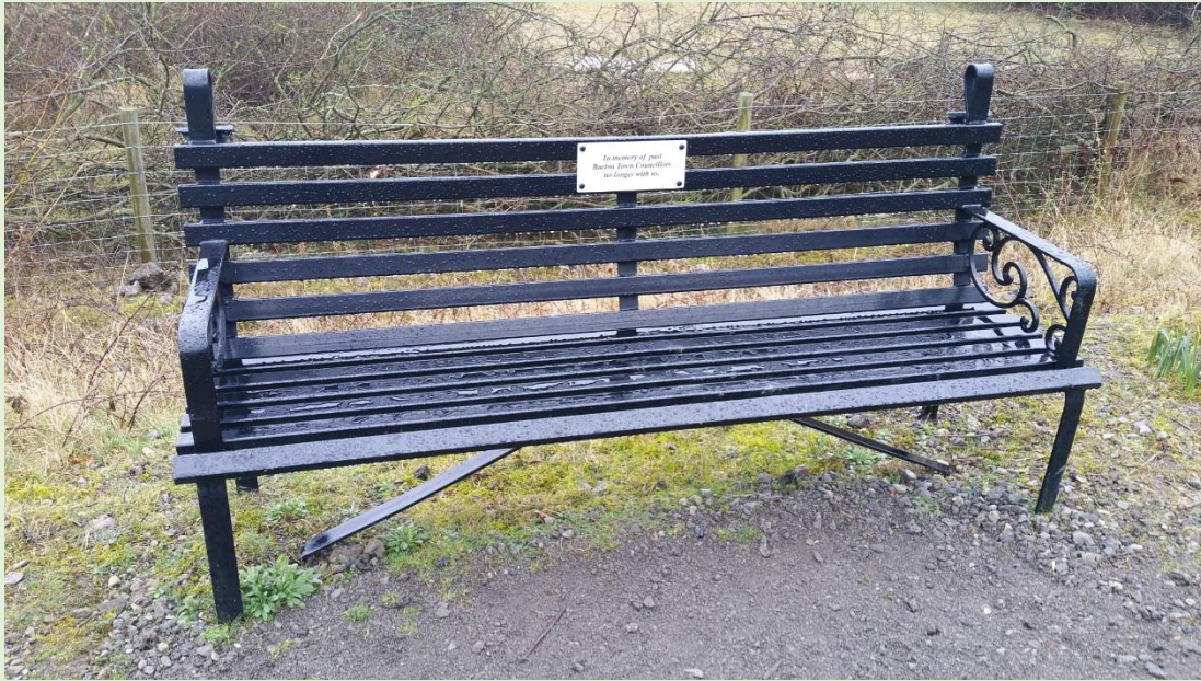
Memorial bench: Millennium Country Park, Bedfordshire